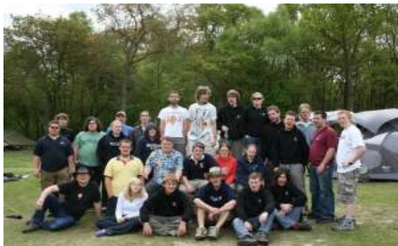
Most of the Continent of South America (a collaboration of EDN, AXE and the Godz)

By Monday we were back at Ferny Crofts, tired but happy to have finished as 3rd placed sub-camp (compared to 5th last year) a good time was had by all, here's to a brilliant summer of EDN!