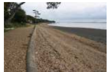
Part of the Solent Way at Netley

Anyone wanting to organise or partake in these challenges should talk to the committee.