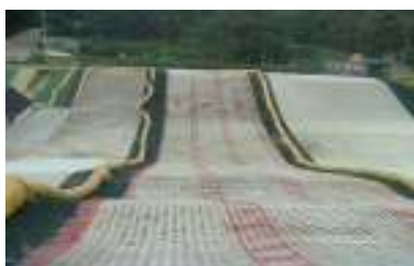
Looking down the Ski-Bob run at Snowtrax

So many good times have been had, many still to come before the year is out for EDN!