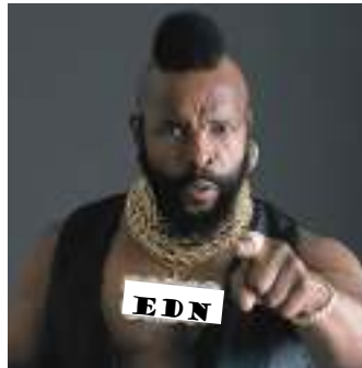
Mr T pity's the fool who doesn't join Network

We're on the web! www.eastleighnetworkscouts.org.uk