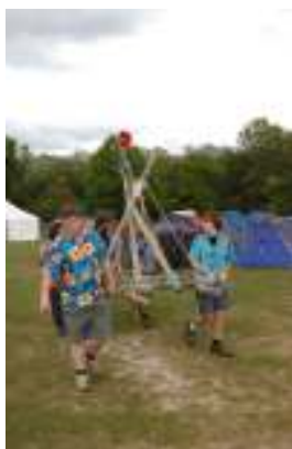
EDN on our way to war with our Catapult named Mini-Me