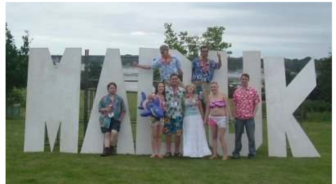
EDN members at MAD UK 2008

swinging 60's! So dust off those flares and mini skirts. EDN have attended this event since 2006. Pictured alongside here is last years EDN contingent to MAD UK, which was on a Hawaiian theme.