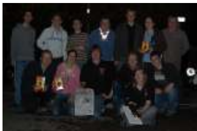
On Wednesday 11th Competitors in the Winchester Monopoly Run.

February Waterlooville Black Sheep Network visited EDN to contest the Hampshire Network Cooking Competition title. Both teams cooked up some dishes that were hard to choose between. Waterlooville ended up winners, shading the competition by 2 whole points. Bad Luck EDN, but we can always try again next year!