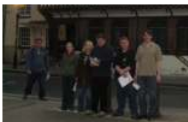
EDN Outside the famous Tudor House in Southampton